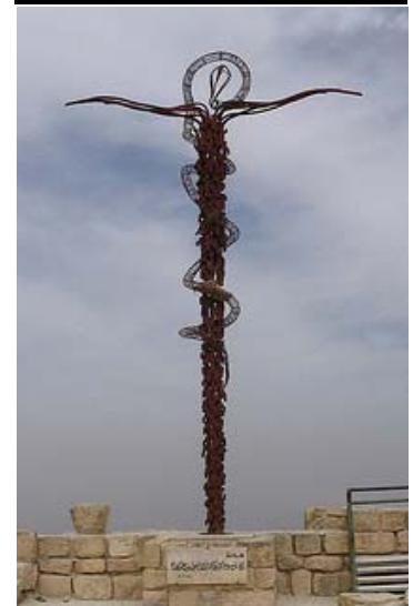
The Brazen Serpent Monument on Mount Nebo created by Italian artist, Giovanni Fantoni. It is symbolic of the bronze serpent created by Moses in the wilderness (Numbers 21:4-9) and the cross upon which Jesus was crucified (John 3:14).